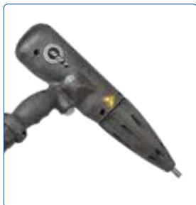
Manual Spray Gun