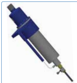
EPX Robotic Spray Gun