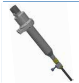
PX Robotic Spray Gun