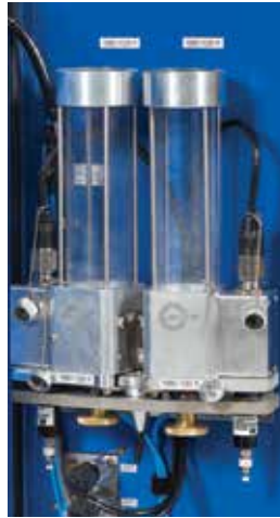
Powder Feed Canisters