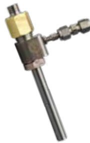
UltiLife™ KN Series Nozzle