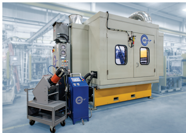
Fig. 3 — Commercial SST cold spray system.

Supersonic spray technology (SST) cold spray enables metal consolidation that can dimensionally restore these tools with minimal or no thermal effects. Therefore, SST manual and robotic cold spray technology, which is operated at low pressures and temperatures, has become a reliable and effective tool in the industry (Fig. 3).