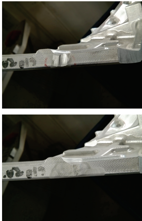
Fig. 5 — Snap-off defect dimensionally repaired with SST cold spray, before (top) and after (bottom).

A local manufacturer of high-precision aluminum gauging fixtures saved thousands of dollars by using the SST cold spray technology to salvage a number of high-value fixtures that were either incorrectly machined or simply worn beyond their useful life. ~iTSSe