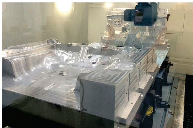
Fig. 1 — Subtractive machining of a geometrically complex aluminum gauging tool for checking automobile polymeric shapes.

Aluminum alloys used to fabricate these components are specially heat treated. These materials are intrinsically sensitive to any process or procedure, such as welding or